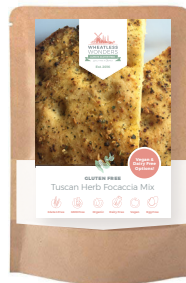
Tuscan Herb Focaccia $10