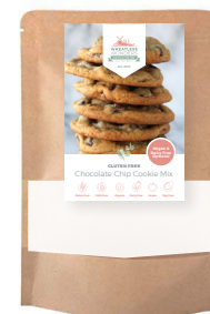
Chocolate Chip Cookies $15