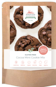
Cocoa Mint Cookies $10