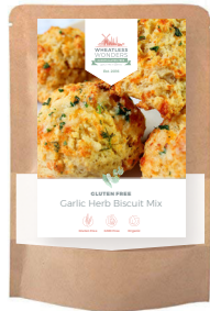
Garlic Herb Biscuit Mix $10