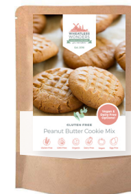
Peanut Butter Cookies $10