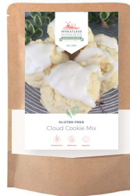
Cloud Cookies $10

We recommend these mixes only be used as Gluten Free. We have tried substitutions for the dairy and eggs but they do not turn out well. See the options in the next row that work great as Dairy Free, Vegan or Egg Free.