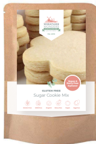
Sugar Cookies $10