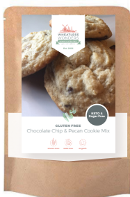
KETO Chocolate Chip Pecan Cookies $15